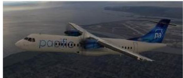
Aerospace ATR72 added to the fleet