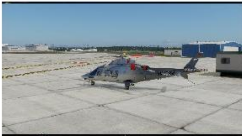
AW-109 SP-XTrident-AW109

The other aircraft we are looking at is the x-Trident AW-109 SP helicopter. Our first company helicopter was the A109-e that is only for FSX. This would give the Xplane pilots an Agusta to fly without adding another aircraft to the fleet, since we already have the A109-e.