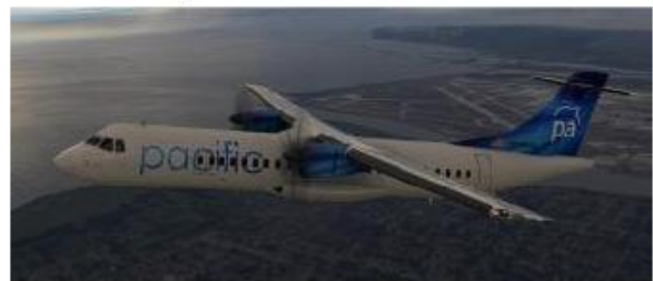
Aerospace ATR72 added to the fleet